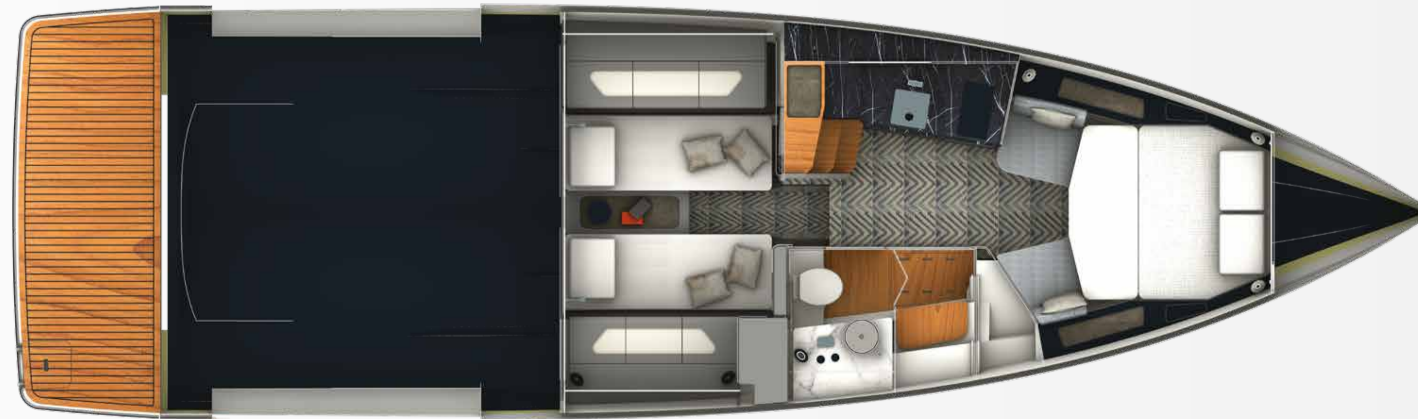
INTERIOR TOP VIEW - BED