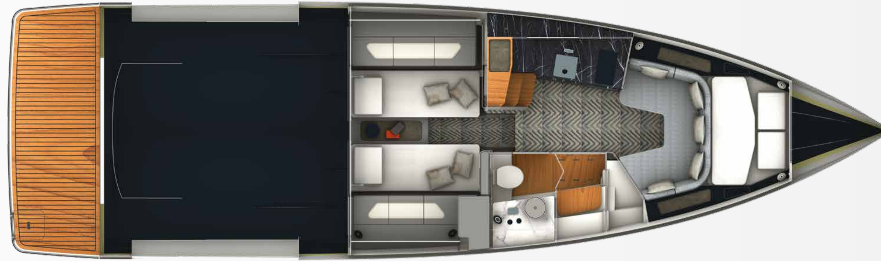
INTERIOR TOP VIEW - SOFA